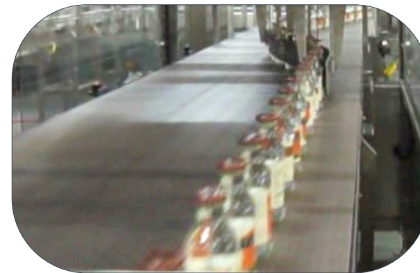
Glass bottles being laned