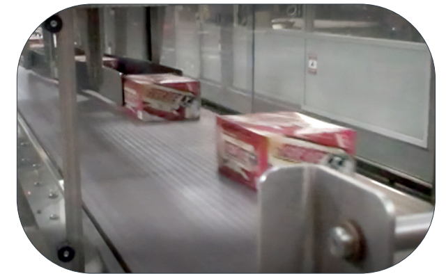
12-packs being laned