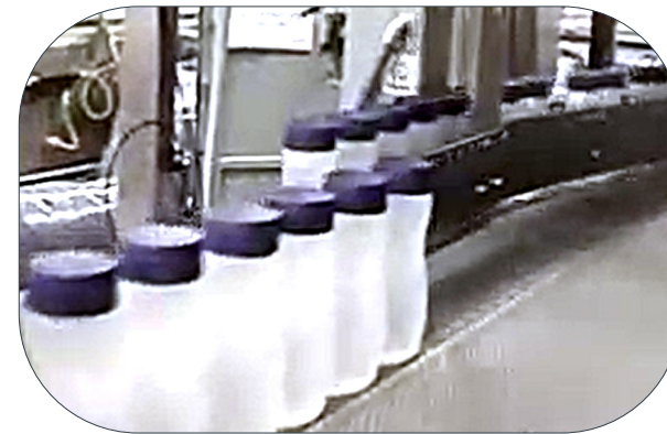
PET bottles being laned

To ensure smooth linear motion, the Cobra Laner utilizes belt driven linear actuators. Additionally, polished stainless-steel brackets are thoughtfully provided to securely connect the conveyor to the Laner. The Cobra’s flex rails are manufactured using durable and low-maintenance machined nylon construction. What’s more, the tool-less changeover process is made hassle-free with the use of manual ratchet handles.